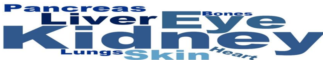
Fig 2: Word cloud showing most commonly enumerated organs donated After Death, by participants Before session.

(At 2 d.f at 5% level of significance the critical value is: 5.991 and the calculated values are less than critical value, so the inter-stream difference is not significant)