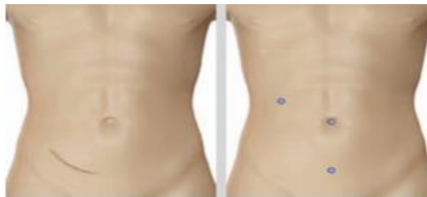
Fig 1: Incision site in open and laparoscopic method.